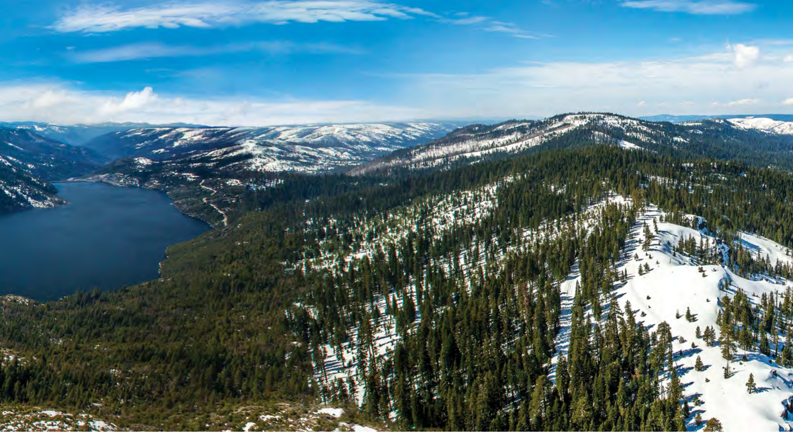
Hell Hole Reservoir (left) and French Meadows Reservoir (right) are located in the upper reaches of the American River watershed. The Sierra Nevada provides more than 60% of California's developed water supply, and clean water is one of the most important benefits provided by forested watersheds.

NEPA. The Forest Service's process for developing, analyzing and approving projects like the French Meadows Project is guided by the National Environmental Policy Act (NEPA) and related regulations and policies. NEPA is one of our country's bedrock environmental laws. Its purposes are to ensure that environmental impacts are considered in federal agency decision making and to provide for opportunities for public engagement in the decision-making process. These are obviously important goals. At the same time, the time and expense required to comply with NEPA can be significant, which has led to a range of legislative, regulatory and policy proposals to "streamline" NEPA.