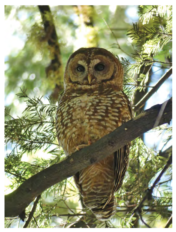
California spotted owl in the French Meadows Project area.