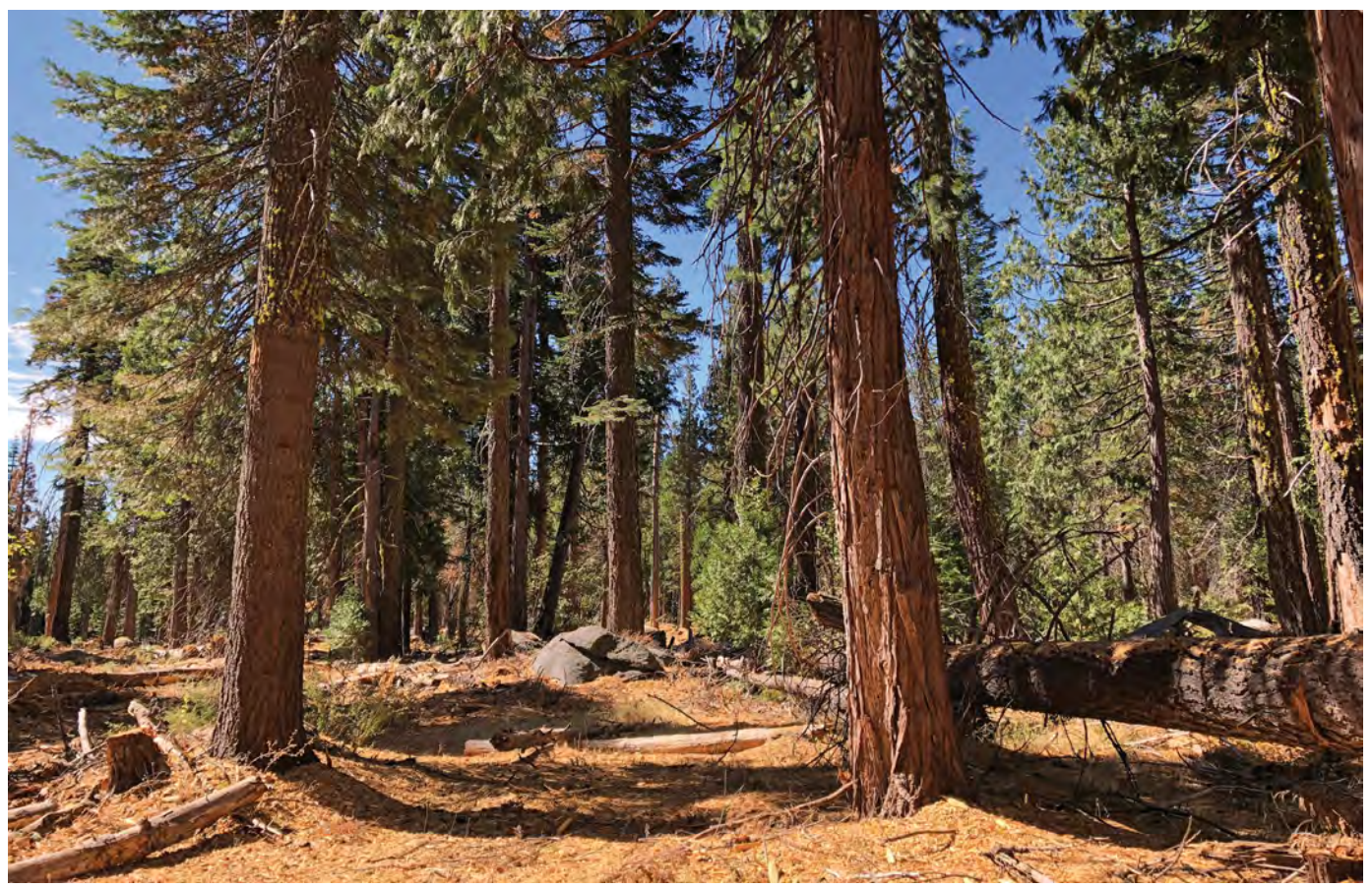
Restoring Forests through Partnership: Lessons Learned from the French Meadows Project

Restoration work on ARC lands.