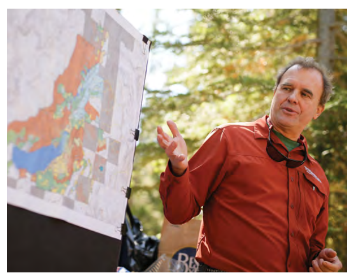
Project partners met regularly in person to design the project to promote long-term forest health and resilience while maintaining important habitat for wildlife.