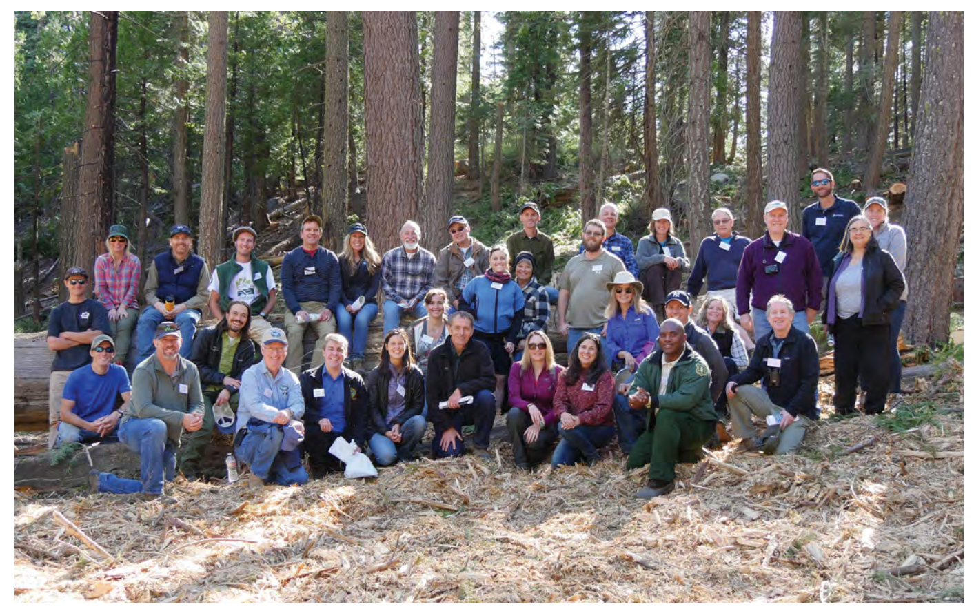
The French Meadows Project is a partnership project, made possible only through the contributions of each partner.

There is a compelling need to better manage Sierra forests to reduce the risk of high-severity wildfire and safeguard all the benefits that healthy forests provide to people and nature. Using a partnership model, the French Meadows Project was developed and approved in less time and using less federal staffing and funding than a typical Forest Service project. The French Meadows Project suggests that effective partnership can play an important role in increasing the pace and scale of ecologically-based forest restoration throughout the Sierra Nevada and beyond.