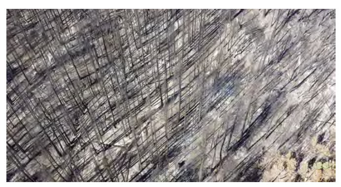
An aerial view of the aftermath of the King Fire of 2014, which burned more than 97,000 acres.

Finally, all the partners shared a concern about the adverse impacts to both people and nature from high-severity wildfire and an interest in increasing the pace and scale of ecologically-based forest management to reduce these risks and promote healthier forests. For example, the Forest Service in 2011 announced its commitment to ecological restoration<sup>2</sup>