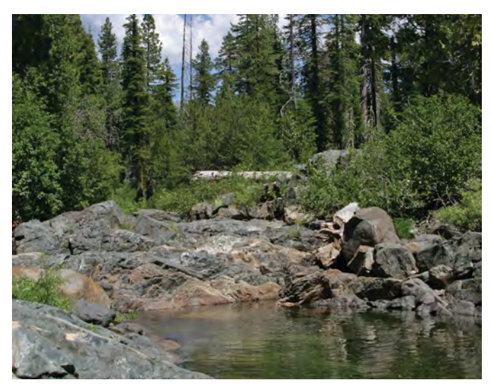
Talbot Creek flows into the French Meadows Reservoir. The Sierra Nevada Research Institute is studying how forest treatments impact forest health and water resources.

The overall out-of-pocket cost of planning the French Meadows Project, from project initiation through project approval, was approximately $1.3 million, or $46 per acre (see table). These planning funds came from a wide variety of sources, including federal funding from the Forest Service and state funding from Sierra Nevada Conservancy. The water utility and local county provided significant funding based on their experience with the King Fire and their concerns about potential adverse impacts to their facilities from a high-severity wildfire in the upper watershed. Many private donors gave to the project through, including funding from private beverage companies, both individually and as part of the California Water Action Collaborative,<sup>7</sup> based on their interests in watershed restoration and research, particularly in watersheds that provide water for company facilities.